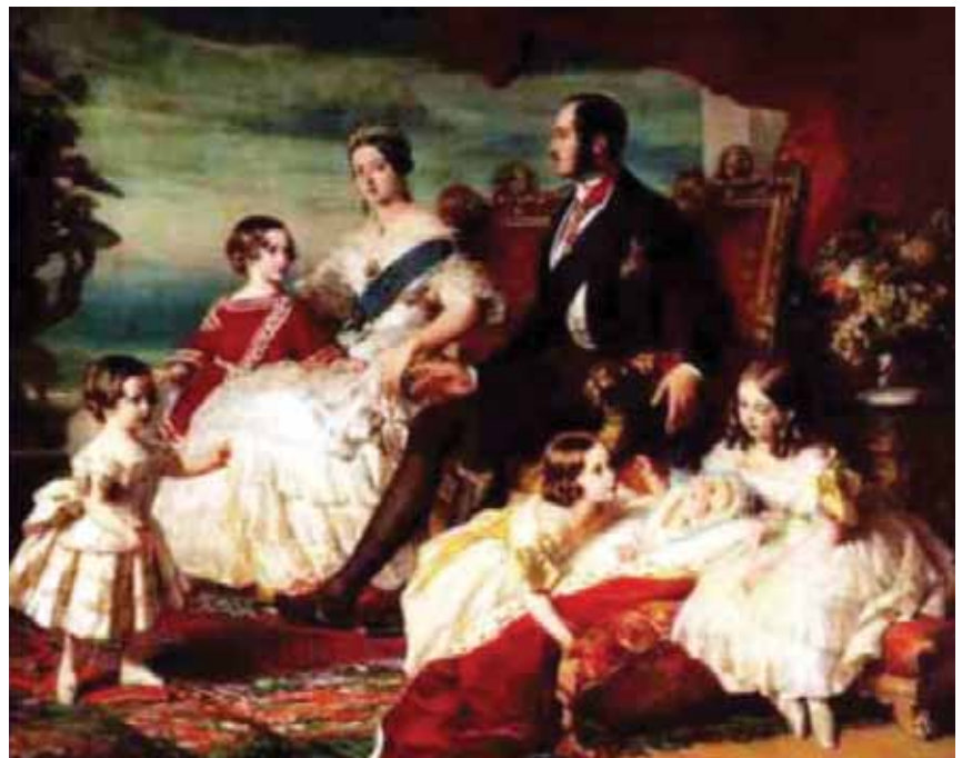
Victoria and Albert with Alfred, Bertie, Alice, Vicky and Helena

At this point the histories of the two diseases diverge as they follow the search for two different treatments. Around the turn of the century the transfusion of serum was determined to be effective in treating bleeding episodes. However, by the 1930’s this practice was being condemned as useless. The reason for this inconsistency